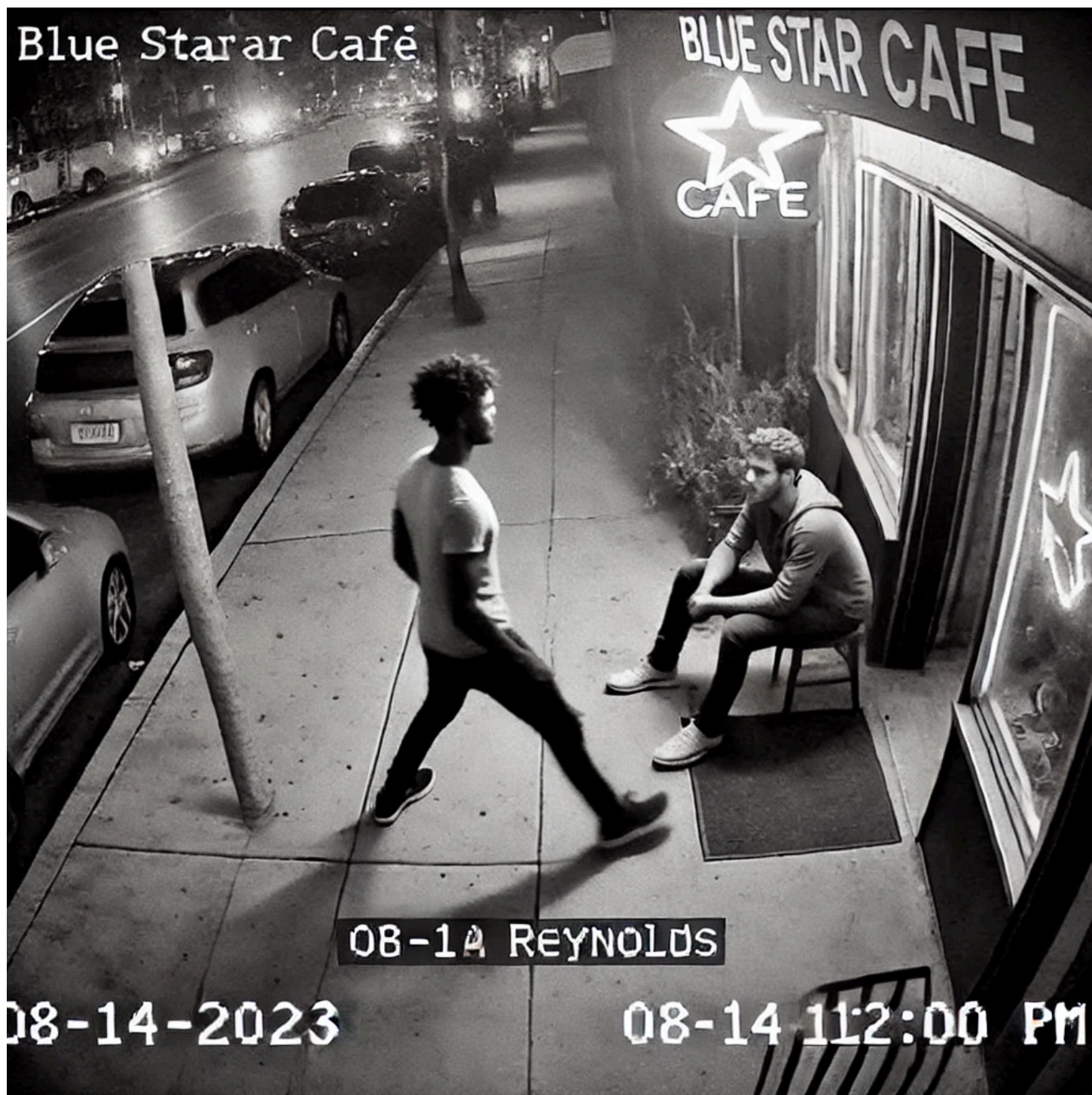
Surveillance image August 14th, 2023 at 11:22 PM